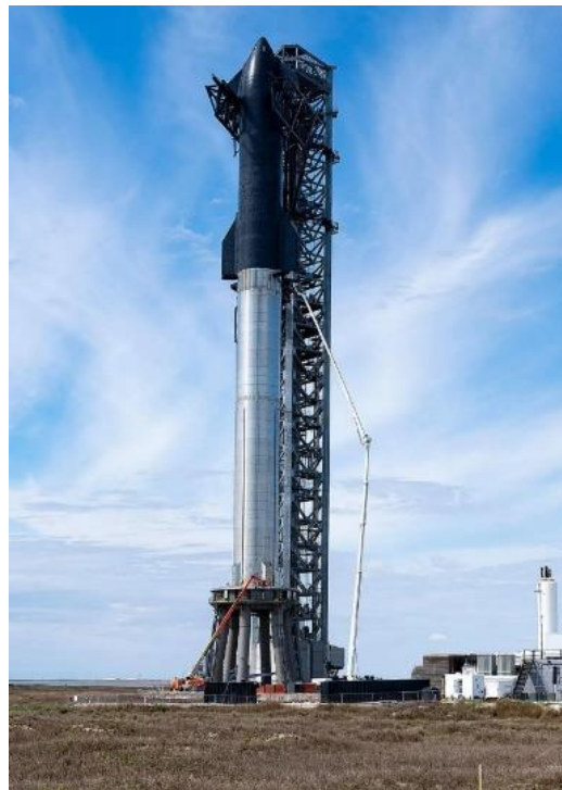
This is an awesome video of the Falcon Heavy booster catch:

In what seemed like a scene from a Sci-Fi movie, after the SpaceX “Starship” blasted off, the company caught it’s Falcon Heavy booster with a mechanical claw 40 stories tall when it returned to the launchpad. The Starship is designed to carry 100 humans at a time to interplanetary space and will be operational in 2025. Look for the private company to send some of these massive Starship’s to Mars in 2026. The first launches will be remote controlled and most likely be loaded with pre-fabricated habitats, seeds & freeze-dried food, solar power plants, and some Cybertrucks. In all of human history this is a great time to be alive.